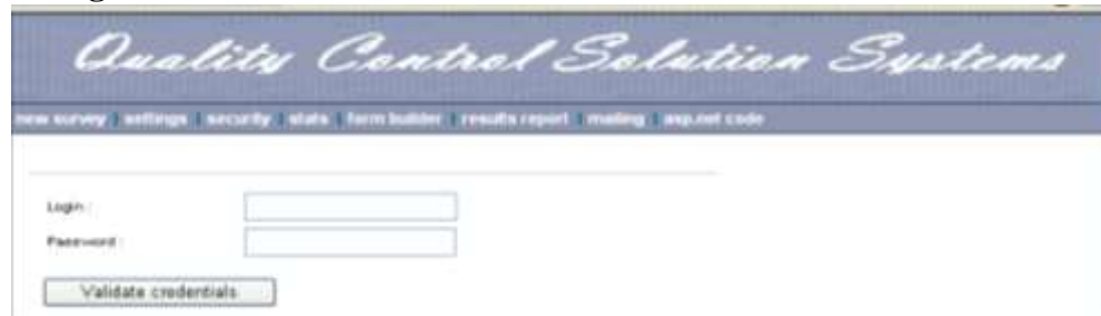
Figure 1. The Login Page authenticates the user to use the Survey System