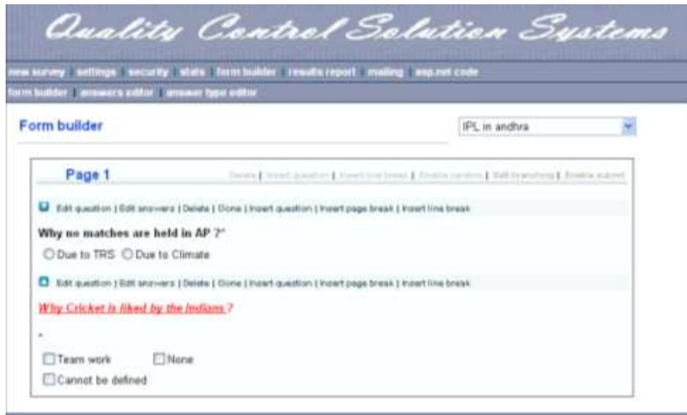
Figure 4. Options made available in the form.