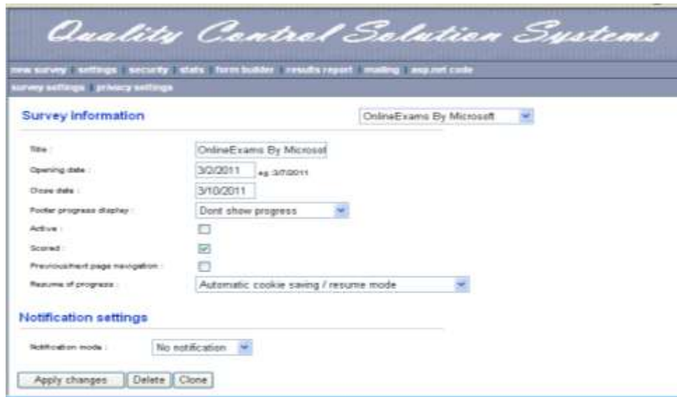
Figure 2. The several inputs to create a new survey has been shown in the above picture.