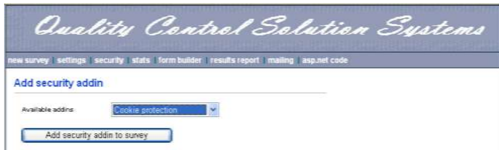
Figure 3. Cookie protection and other security terms can be set in the survey security component.