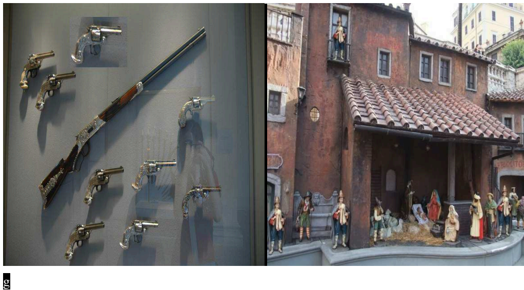
fig.4: Forged images of dataset MICC-F8multi

Another one is a project1ims set of 5 object images (named [name].pgm , where [name] = \{book1, book2, kit, ball, juice\} is the object shown), and two sets of 10 cluttered scene images. One set is the training set and the images are named Img0[i].pgm , where i=1...10 . The other set is the test set, and the images are named TestImg0[i].pgm , where i=1...10 . Every image (in training and test sets) contains 0-5 of the objects represented in the object images. Each object is contained in exactly five images in each set (training and test), and is not present in the other five. There is a file gt.txt , which contains the ground truth for the cluttered images - it shows which of the five objects are present in each images. Steps to analyze method is as follows-