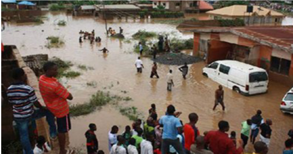
Picture 1. A flooded community in Ibadan