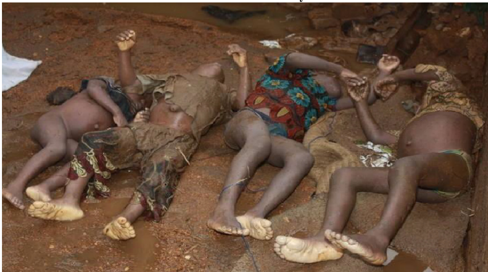
Picture 2. Victims of the flood in Ibadan