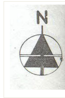
Plate 1: Intersection Location