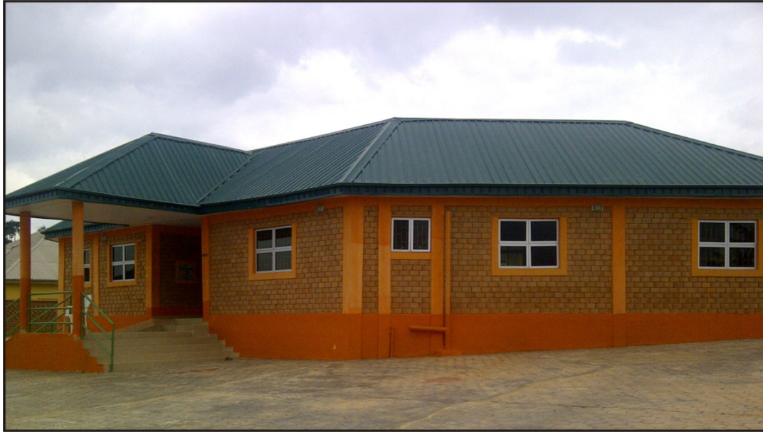
Figure 2: CSIEB used for the construction of a caring heart mega school, Famese, Isokan, Akure, Ondo state Source: Field survey (2015)