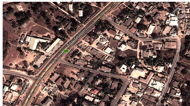
Plate I aerial view of Anglo-Jos.