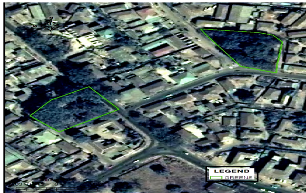
Plate III aerial view of Tafawa Balewa and Vander Puye.