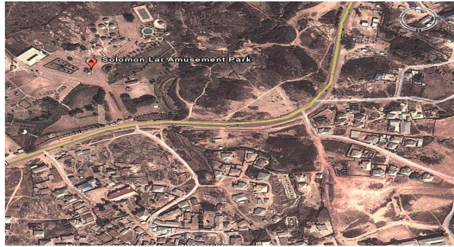
Plate II aerial view of Tudun Wada.