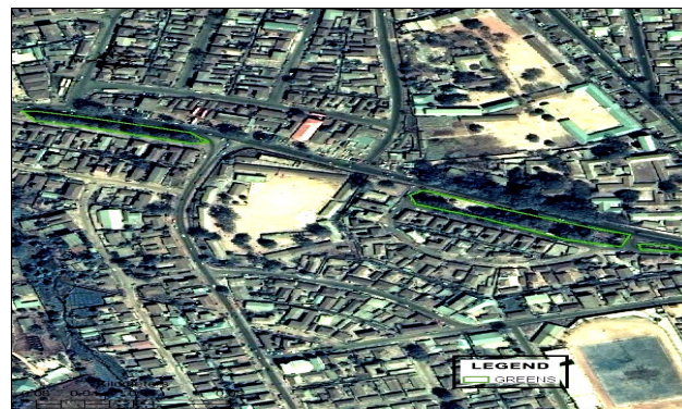
Plate IV aerial view of Zaria Crescent.