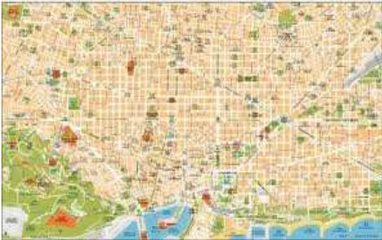
Figure 4: Amman 2025 Draft Plan (Greater Amman Municipality, 2009)