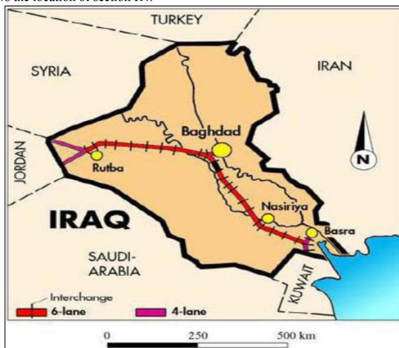
Plate (1) Location of Section R4/Expressway No.1 in Iraq

The study area is a part of section R/4B which starts at station 49+000 Km and ends at station 53+500 Km, the total length of the study area is 4.5 km which is located at the beginning of section R/4B at AL-Latifya city. Plate (1) shows the location of section R4.