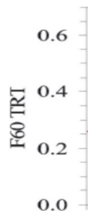
Figure (2) F60 Scale. (McDaniel, R. S., and K. J. Kowalski, 2012)

Skid resistance was assessed based on (IFI) (International Friction Index). A scale ranging (0.0-0.6) as shown in Figure (2), IFI of 0.6 indicates that the pavement seems to be in a good texture.