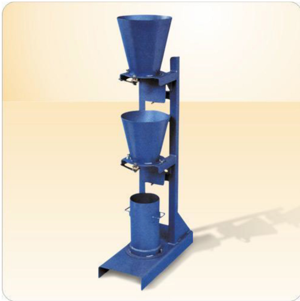
Figure 2.2: Compacting factor Apparatus