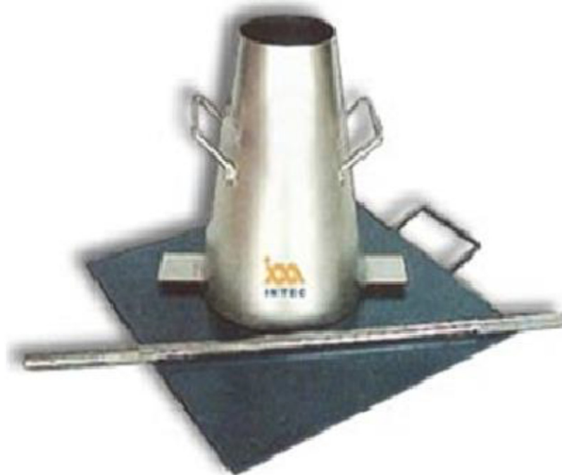
Figure 2.1(a): Slump Apparatus