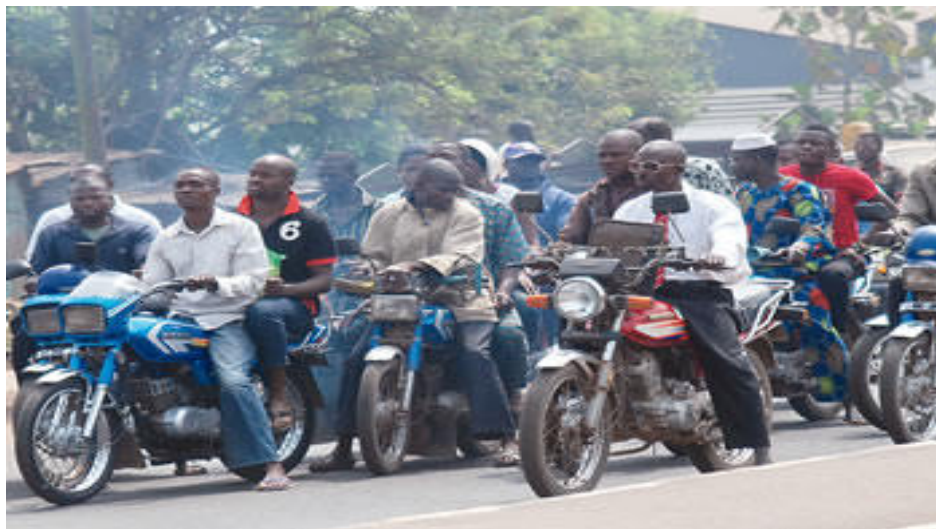
Plate 3 Operation of okada at Alakia junction Ibadan.