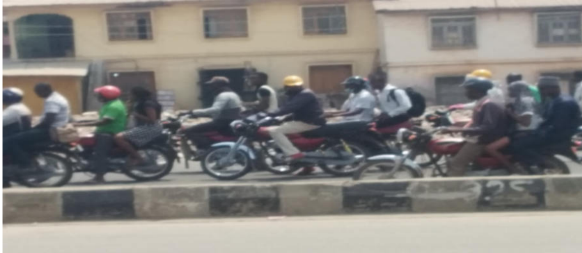
Plate : 1 Motorcycle Operation at Monatan Ibadan.