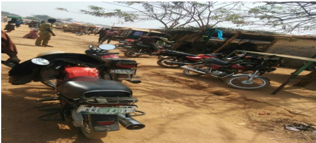
Plate 2 Operation of motorcycle at Orogbanga Ibadan