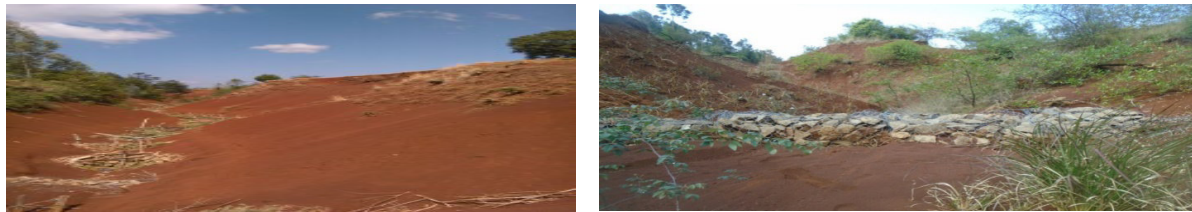
Figure 1: Gabion Structure to Conserve Soil and Water in the Study Area