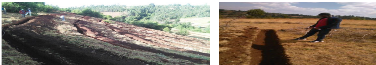
Figure 2: Soil Bunds Practice in the Study Area

Soil bunds are a physical construction of soil to boom infiltrations by decreasing the speed of runoff. As table 1 below said that 85%, 56%, and 18.6% of the respondents in the highland, midland and lowland respectively of the replied as they have participated within the soil bunds practices. This suggests that soil bund is more practised in the highland and midland than lowland, because of the soil form of lowland is difficult to prevent soil erosion and its topography isn't always that much hard as compared with the 2 agro-ecology. Key informants explained that in the look area soil bunds were applied to cultivated lands with slopes above 3 -15% gradient and on grazing lands with mild slopes at wider intervals (as much as 5% slope). It can be carried out so on sloping farm regions blended with coins crops (see figure 2 below).