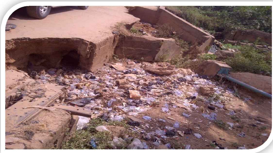
Plate I: Improper disposal of waste into the drainage channel causing flood in Apete Area.