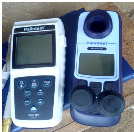
Figure 2. Palintest Micro800 Multi(left) and PalintestTurbimeter(right)

2.2.2. Data collected at the sampling sites: the following parameters such as water temperature ( ^{\circ}C ), pH, Total Dissolved Solids (TDS) ( mg l^{-1} ) and conductivity ( \mu s cm^{-1} ) were measured using Palintest Micro800 Multi, turbidity was measured by Palintest Turbimeter and water transparency (cm) were measured by using Secchi-disc.