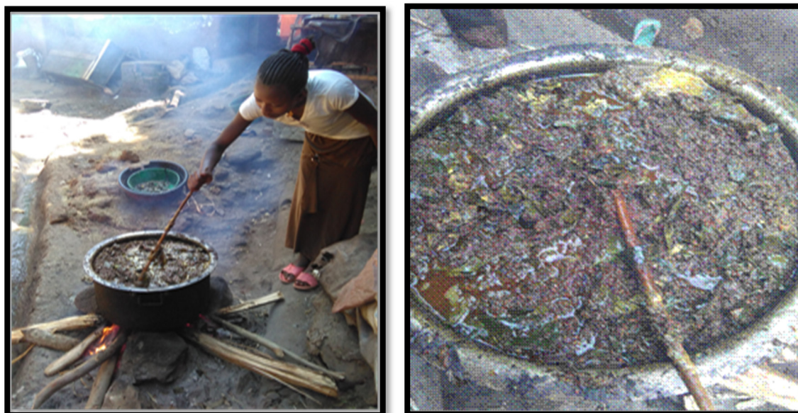
Photo 2: Wax processing at local mead houses (mixed with some ‘ Rhamnus prinoides ’ leaves)

The paraffin and other waxes indicate the contamination or adulteration of natural beeswax with other waxes sources. According to the test result for paraffin and other waxes, all the samples collected in the studied areas have passed the test that the liquid should become cloudy at a temperature lower than 61°C.