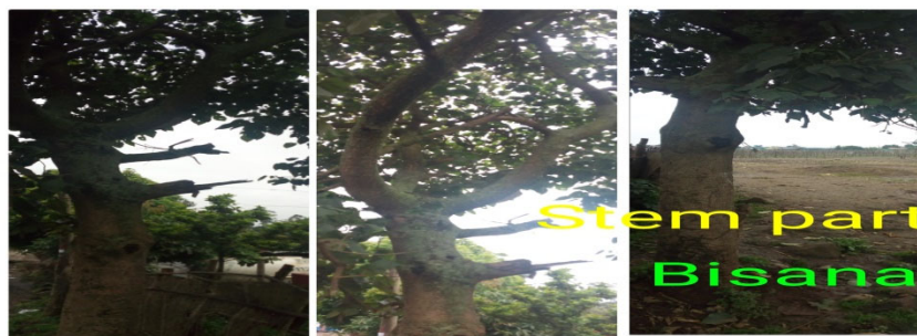
Fig. 1. C. macrostachyus : (Picture taken by Teshale A. during data collection)

Finally, the solvent free residue was soaked with 500ml of methanol, and then it was filtrated by using Whatman no.1 filter paper and concentrated under reduced pressure using the Rotavapor and its extract was afforded many spots on TLC. There was no visible spot for n-hexane extract, but chloroform extracts showed colored spots by using solvent system of n-hexane: chloroform (2:8) and crude extract was dissolved in itself with equivalent amount of silica gel, dried using Rotavapor and applied to a silica gel (200g) column chromatography which was packed with n-hexane (100%).