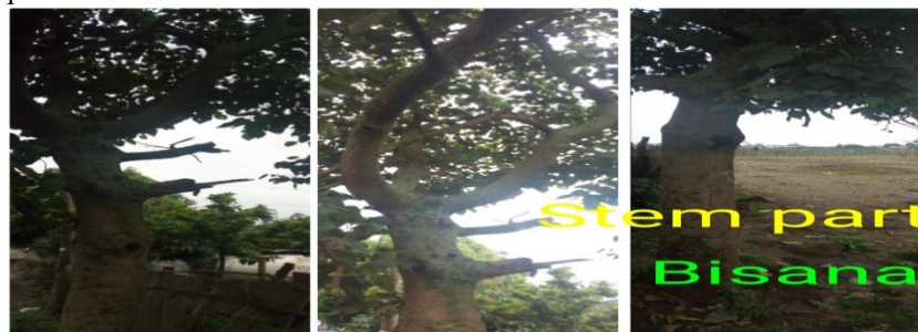
Fig. 1. C. macrostachyus : (Picture taken by Teshale A. during data collection)

RV-10 basic Rotavapor. The solvent free residue was then soaked with 500ml of chloroform (CF) for 36 hours with frequently shaking and the extract was collected. This filtrate was evaporated under reduced pressure using the Rotavapor.