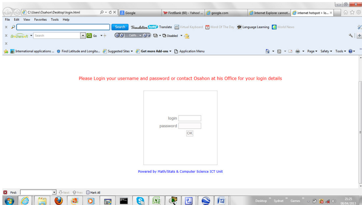
Fig 3.0. Login Interface for the monitoring system

A successful log in would produce a welcome screen of figure 4.0 where the details on the transaction are shown. Parameters such as the IP address, the connection status, the quantity of data up-loaded and or downloaded are all displayed.