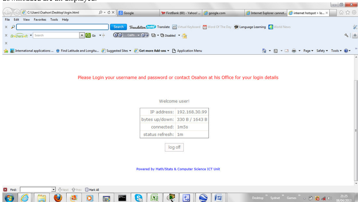
Fig 4.0 A welcome display window of the packet monitoring system

A successful log in would produce a welcome screen of figure 4.0 where the details on the transaction are shown. Parameters such as the IP address, the connection status, the quantity of data up-loaded and or downloaded are all displayed.