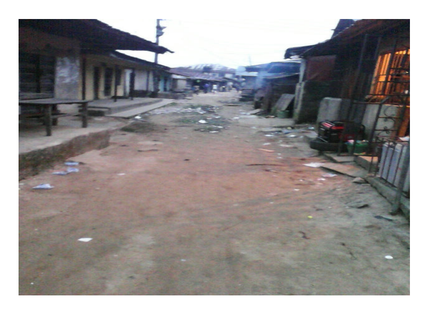
Figure 2. A typical slum in the growing city where environmental standards are absent

On assumption of office, the state government did not need anyone to announce to it that the major task confronting it was to develop a befitting State capital out of Yenegoa and the surrounding villages lying forlorn in the creeks. These are villages neglected by the Nigerian State for a long time but which now share in the status of oil rich State capital. The circumstance of her geography was another challenge to spatial development that the government knew it had to contend with. In its eighteen years of existence, several billions of naira had entered into the coffers of successive governments or administrations meant for development of the state. Each administration from that of Chief Diepriye Alamieyesigha to the present government of Hon. Seriake Dickson, the main challenge has been the development of a model capital city for Bayelsa State. At the embryonic stage there was the absence of spatial plan to control physical development. Thus transforming Yenegoa into a model city with appreciable beauty and modern