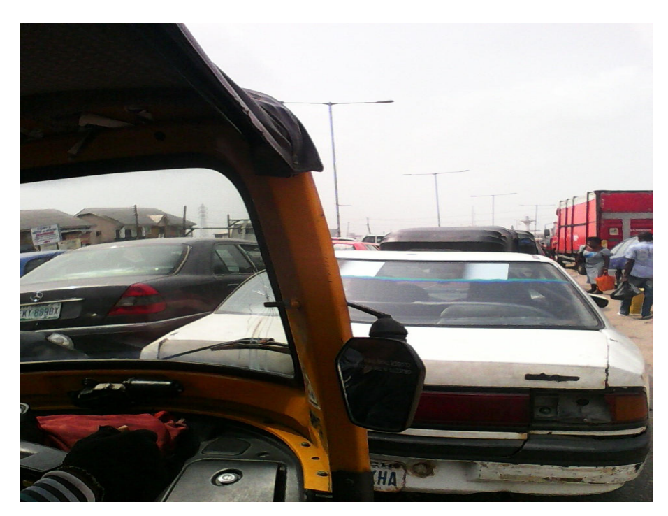
Figure 3. Traffic congestion is a daily feature along the Mbiama-Yenegoa road. At some points during the peak hours, the road could be locked for hours thereby increasing travel time and cost.

In its eighteen years of existence, public housing provision has never been included in the "priority list" of the different administration that had governed the State. What this means is that the public have to depend on the private sector for shelter. Home ownership in the city is a herculean task because of its difficult geographical terrain (most of the land are lying under water). Raising a standard physical structure in the city is more expensive when compared with what obtains in some other cities in Nigeria (See table 2). This has also affected cost of rental accommodation in the city(see table 3).