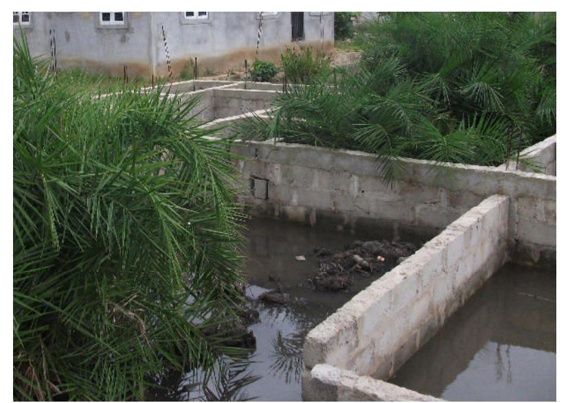
Figure 5. The pains of developing a home in a city under siege by persistent flooding

for standards. Most of the adjoining streets are just mere miles stretch of sandy paths that runs into the creeks, without adequate side drains and are often flooded during heavy rainfall thereby subjecting residents to further nightmare. The width and thickness of some of these roads also places a question mark on planning standards. Streets are too narrow to even permit one sided on-street-parking.