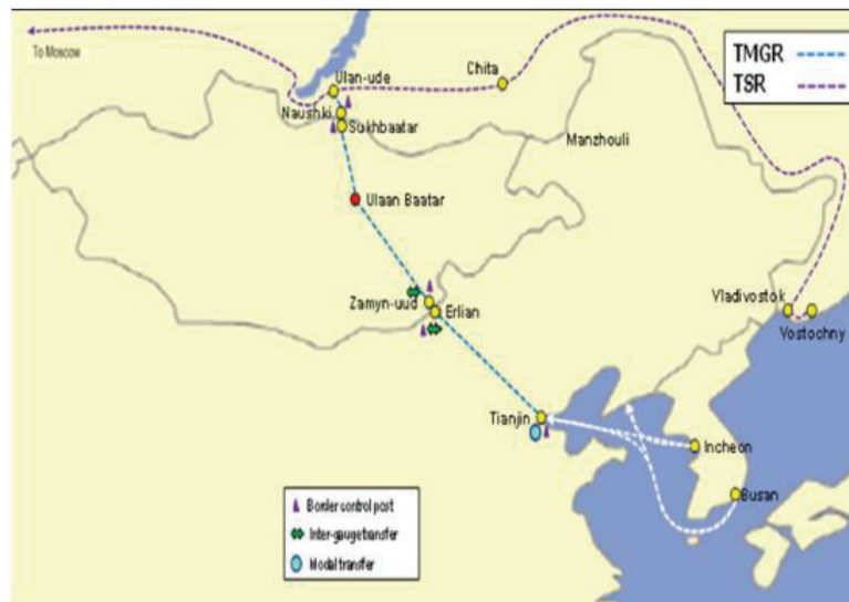
Figure 2. Railway from Tianjin to Mongolia

Tianjin port-Mongolia transportation challenges, consists of the main challenges present in every transportation method that is used by a person to transport his goods from Tianjin port to Mongolia or from Mongolia to Tianjin port. It is well known that Mongolia is connected to Tianjin port by railway and road. Hence in this particular case, we may differentiate these transportation means by the railway mode and the road mode. In what concerns the railway mode, as shown in the Figure 2 below, there is a railway that exists between China and Russia and that passes through Mongolia. The data were collected from the Ministry of Foreign Affairs of Mongolia.