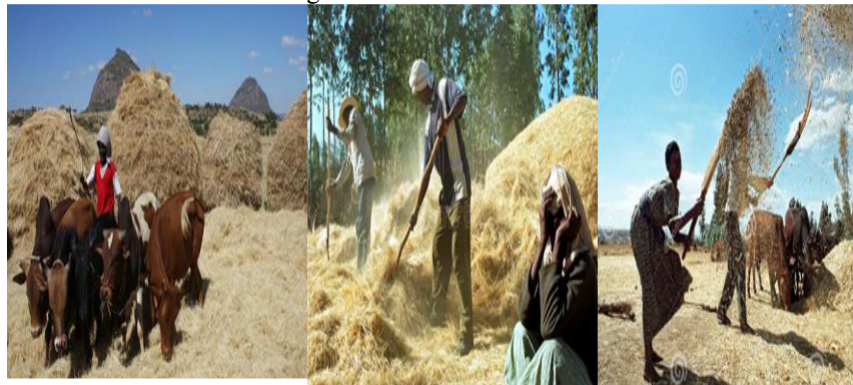
Figure 1. Traditional threshing

In Ethiopia, soya bean is threshed by stick beating and by being trodden under hooves of animals as no proper mechanical thresher was available. There is little doubt that these processes are tedious and labor intensive. In Ethiopia, It was found that the operation might pull children out of school since processing food for survival takes priority over education in subsistence farming households