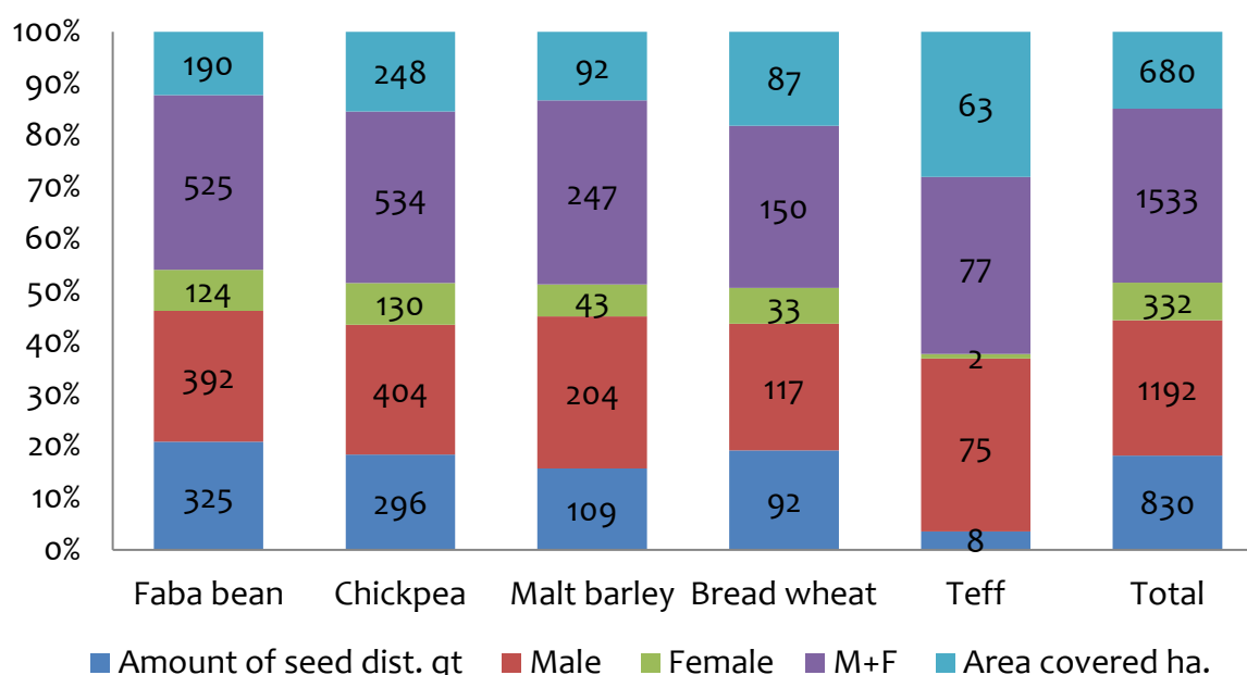
Figure 1. Crop technologies distributed for the target Districts in CBSP by Holetta ARC from 2015 to 2017/18 cropping season for seed producer cooperatives.