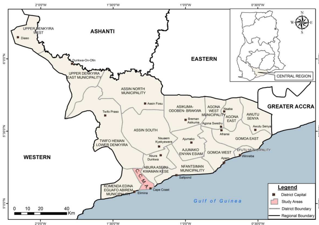
Figure 1: Cape Coast Metropolis in Regional and National Context

Cape Coast became a good ground for investigation into the operation of National Health Insurance Scheme because the city boasts of a fair array of health services. The city has a regional hospital, metropolitan hospital, health centres, clinics, pharmacies and Community Health Planning and Services (CHIPS) compound. The health services providing institutions could also be classified into government and private entities. The Central Region has also been witnessing a reduction in poverty levels. Poverty level in the region reduced from 31.0 percent below the poverty line in 1998/1999 to 9.7 percent below the poverty line in 2005/2006 (NDPC, 2010). It therefore became important to examine how the NHIS programme has been contributing towards the reduction of social exclusion by getting all segments of the population access to health services, especially the poor.