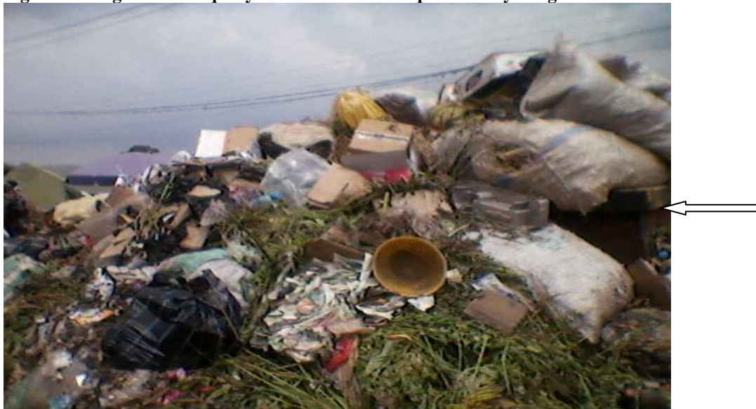
Fig 4. Showings the inadequacy of waste containers provided by the government.

Hence while respondents perceive that they are keeping their immediate environment clean, it still does not prevent environmental pollution as attempts to prevent their immediate environment from getting polluted invariably increase the pollution of the larger market and its surrounding environs as measures put in place to ensure proper waste disposal are inadequate. Fig 3. Above shows waste dumped on the road side some distance from the market. The pollution in the market is therefore due to “illegal” disposal of wastes which is probably being due to lack of adequate waste containers in the market as shown in fig 4. The arrow shows the waste container that is almost covered up with refuse.