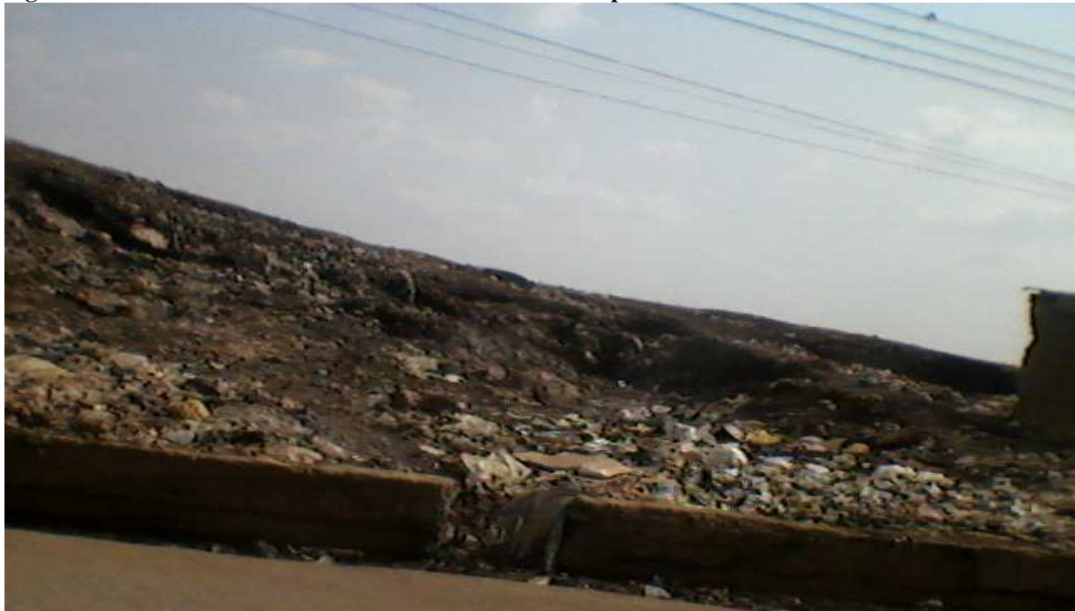
Fig 1. A site around three restaurants where refuse are dumped in the market