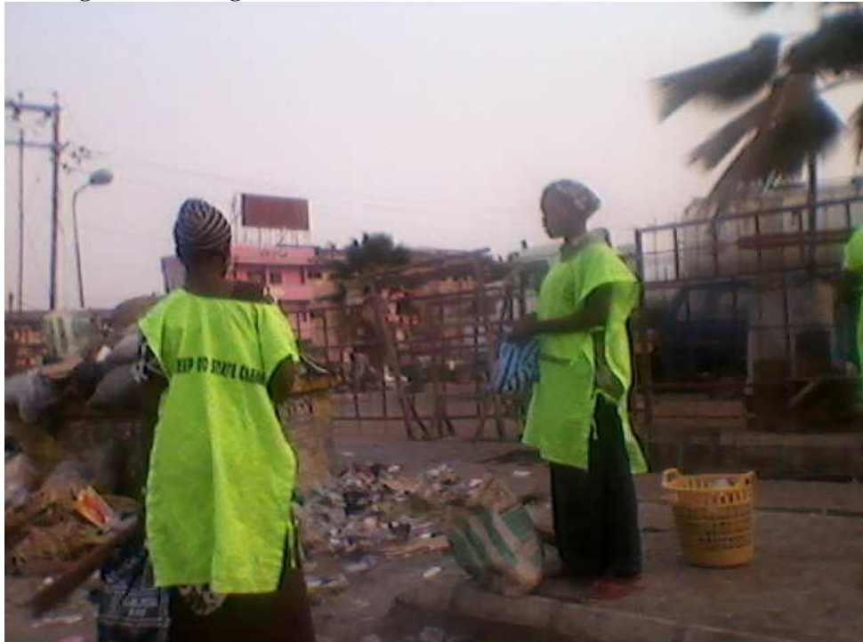
Fig 6: Showing government cleaners grumbling over a dirty surrounding around a waste container in the morning while cleaning

and untidy both throughout the night and during morning hours until the cleaners who have been recruited by the government come around to do the cleaning. Thus, making the cycle of environmental pollution to continue. Fig 6. shows government cleaners complaining over a dirty surrounding around a waste container while cleaning in the early hours of the morning.