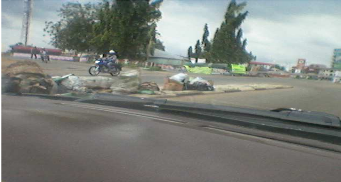
Fig 3. Improper dumping of waste along the major road some distance from the market