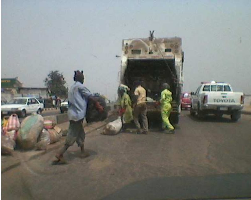
Fig 5. Showing the government lorry that comes to remove the dirt.

The above response also reveals that government is making frantic efforts to curb environmental pollution through the provision of waste containers and lorries as well as empowering youth through the YOUTH Empowerment Scheme of Oyo state popularly referred to as “YES” O. Fig 5 below shows the government lorries that comes to remove the refuse