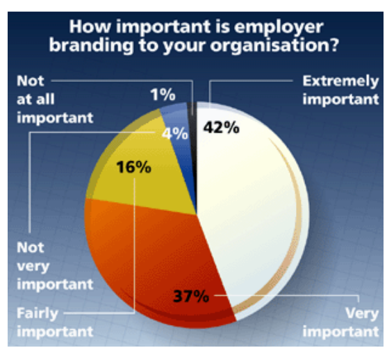
Figure 1.3: Importance of employer branding to the organizations (Personnel Today 2005).

Erickson and Gratton (2007) confined themselves to sorting out the answer of the question: "what it means to work here?" They came to find out that organizations that brilliantly develop and communicate moniker experiences realize that diverse kinds of people will shine at different organizations, and that not all employees demand the same things. Then they came to propose that to encourage profoundly committed workers three elements of engagement for an organization are required. First, a holistic comprehension of prospective workers' characteristics is required. Second, a planned strategy to interact an employer image that on the one side transmits characteristics and values of the organization to prospective hires and on the opposite side strengthens those to workers is essential. Third, a consistent worker experience is a must include via communication. Finally Erickson and Gratton (2007) came to say that more than one employer branding strategy is needed to undertake by companies since there are diversified characteristics of the employers' image of branding target groups. Every individual group must be dealt with by another strategy.