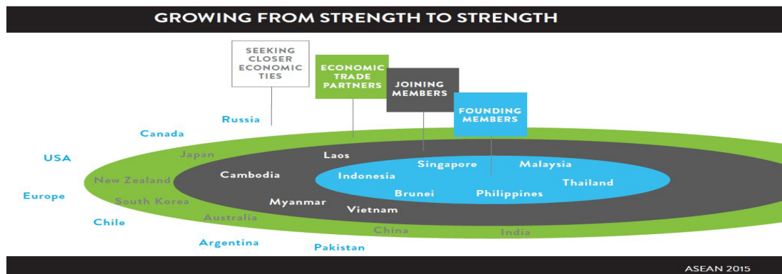
Figure: 1. Future growth of ASEAN and trade partners

These blueprints offer a deep penetration into the complex tapestry of agreements and regulations that are needed to attain ASEAN's primary ambition, even though the ambition itself is comparatively simple: "In short, the AEC will renovate ASEAN into a region with free movement of goods, investment, services, skilled labour, and freer flow of capital."