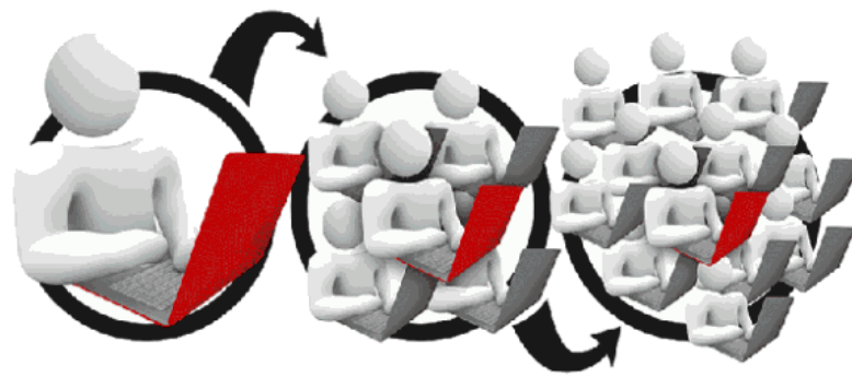
Figure. 3: Viral Marketing Strategy (Viral Marketing Strategy, 2009)

Brown & Reingen (1987) consider that old research on word of mouth communication had not efficiently look at the impact on groups. Old research was failed to conclude how word of mouth begin with the individual and ends up aggregating to large group. The role of word of mouth communication in interpersonal process and determine how this is being interviewed in the macro and micro word of mouth process. Viral Marketing Strategy (2009) discusses on internet-based automatic marketing campaigns, including the use of blogs, seemingly unprofessional sites, and designed to create huge word of mouth for a new items or services. The purpose of viral marketing campaigns is to create media coverage via “offbeat” stories values more than the advertising budget of campaigning company.