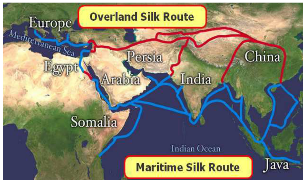
Figure-2. Maritime Silk Route (Mrunal, 2014).