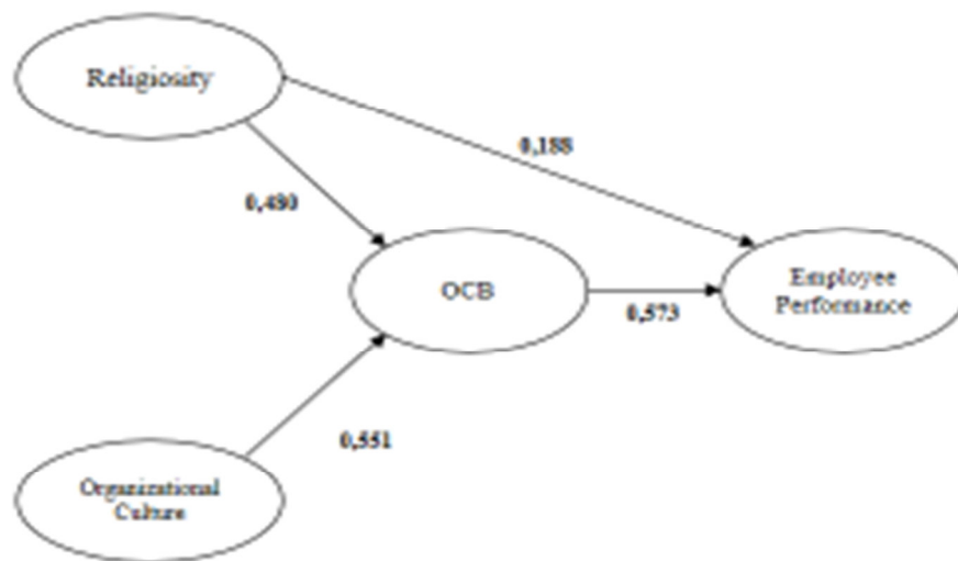
Figure 2 : The Proposed Model From The Research

Based on the above explanation and discussion, it is concluded that organizational citizenship behaviors (OCB) has strong and significant influence on the employee performance in NIPA's regional offices. To determine the relationships among all variables of this study, Figure 2 displays the trimming model, resulted from the data analysis from the research as follows: