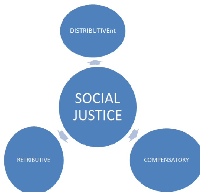
Figure 2: Basic Social Justice