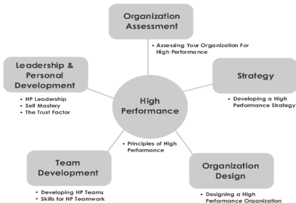
Figure 1: High performance Model