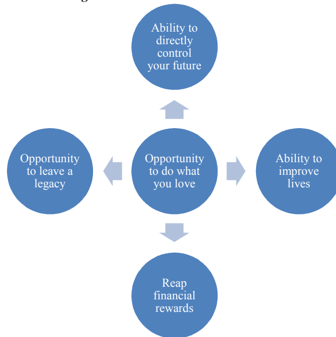
Diagram 4.1 The 5 Benefits of Owning a Business

Most entrepreneurs enjoy various benefits from owning a SMME and these are depicted in Diagram 4.1.