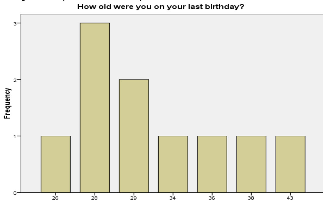
BarChart 4.1.4 How old were you on your last birthday?

The respondents belonged to the following age categories. The lowest age was 26 years while the highest was 43 years. The ages of the respondents above are as represented on the bar chart below: