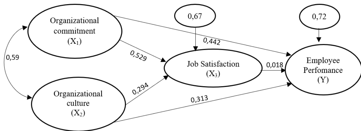
Explanation Figure 2.5.1 on the influence of organizational commitment and organizational culture on job satisfaction and employee performance. Figure 2.5.1 Analysis Results