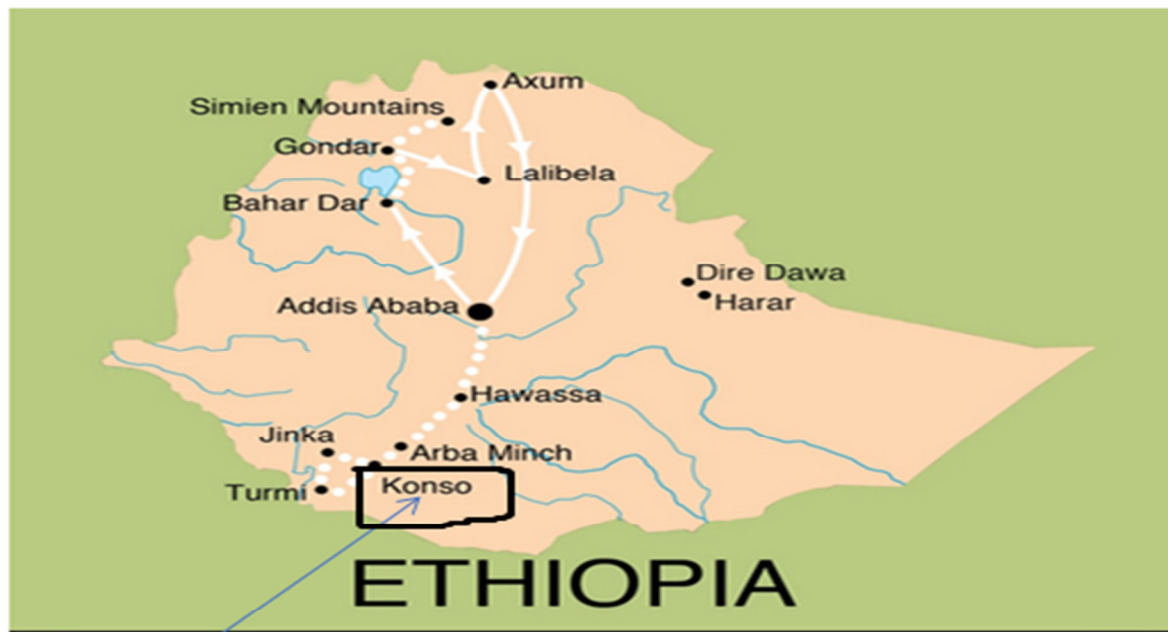
Fig 2 Map of the study area