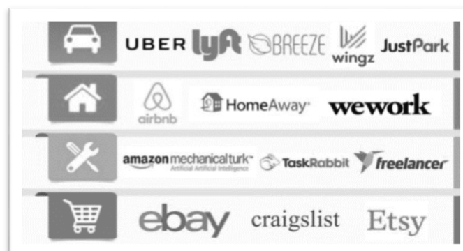
Figure 1.1: Some notable firms within sectors of the sharing economy