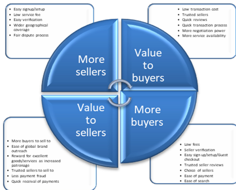
Figure 2.1: How firms use technology to mitigate the two-sided market (chicken and egg) problem. Based on the above diagram, there is a tendency to assume the network effect strategy solves the two-sided

However, from a strategic standpoint, Cusumano (2015) argued that combining the platform and technology is not enough towards guaranteeing a firm's success in providing a sharing platform as a service. Along this line of thought, leading firms in sharing economy platforms have had to think critically about strategies that can help them penetrate the two-sided market mostly present on most sharing platforms (like Airbnb, Lyft, Uber, HomeAway, Fiverr, ZipCar). Notable among the problems they faced is that incessantly discussed by Lou and Koh (2018) and colloquially referred to as the chicken and egg problem; one used to describe the imbalance when the service's value proposition to the customers and the suppliers heavily depend on the penetration on the other. There is often a question about which side deserves more enticement and in which order the enticement should be introduced.