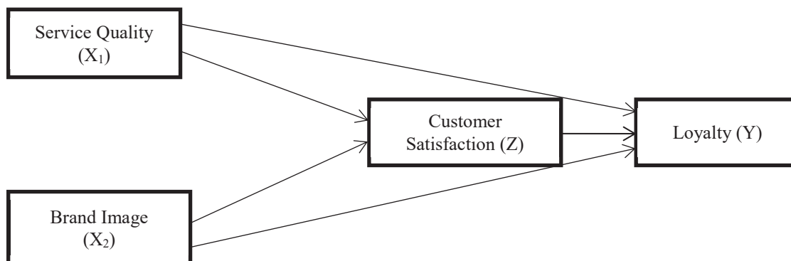
Figure 1. Research Design