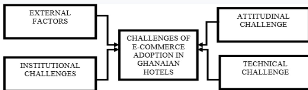
FIG 3.0 Framework of E-commerce Adoption challenge in Ghanaian Hotels

Many publications and write-ups of e-business commend the massive potential and prospects provided for consumers and business globally. Nonetheless, there are some problems (Mark Bynoe, 2002). Some of these include,