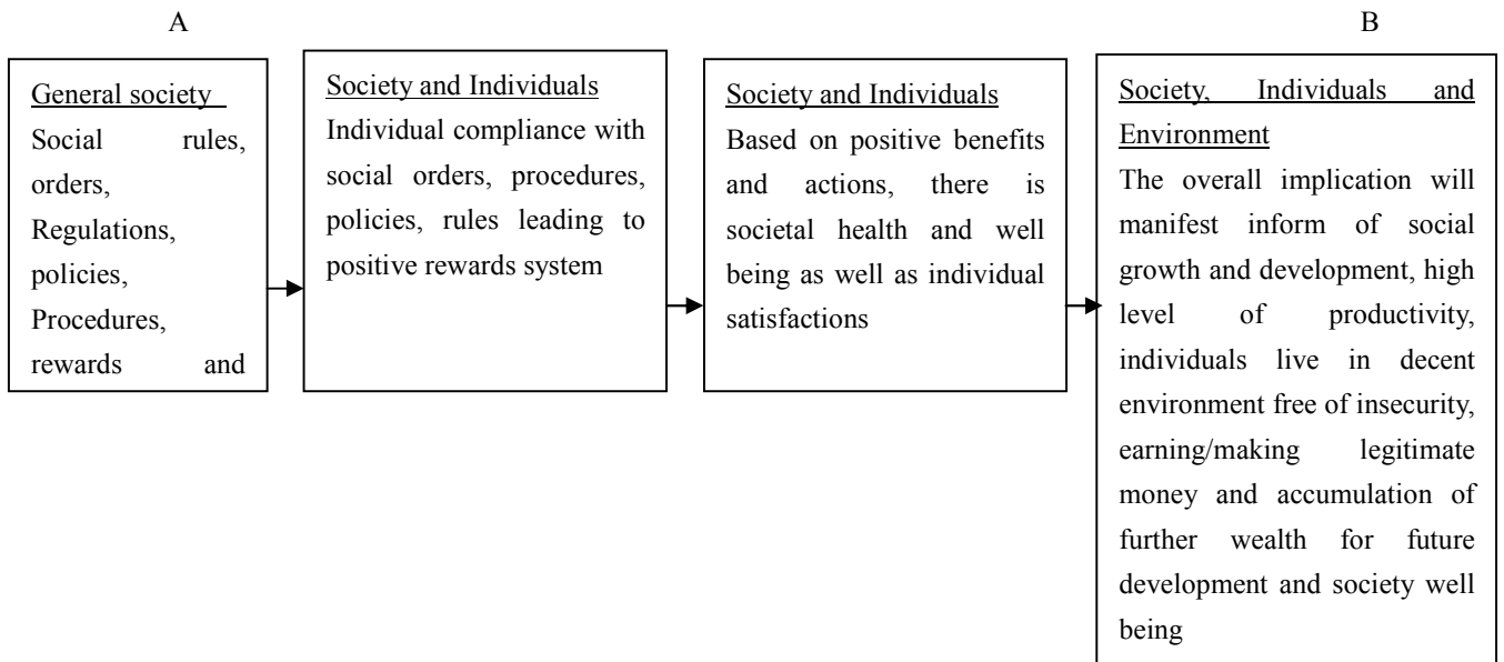
Fig1. Model of society where discipline acts dominates: (somewhat free of corruption)