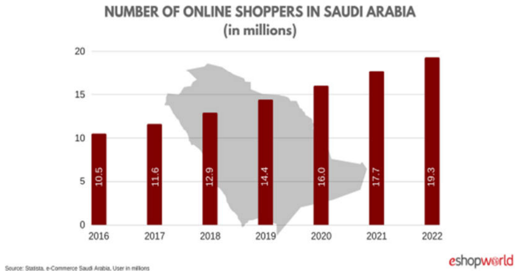
Figure1: Number of online shoppers in K.S.A. (in millions)

In spite of having extraordinary online savviness, Saudi Arabian e-commerce sector is developing slowly. With an intake per capita of $8,329 plus the second leading mobile broadband saturation in the world, Saudi Arabia has merely 1.4 percent of e- retail concentration. Smartphones have a tendency to be utilized for social media, where the mediocre Saudi passes 7 hours per day (Garrós, 2019).