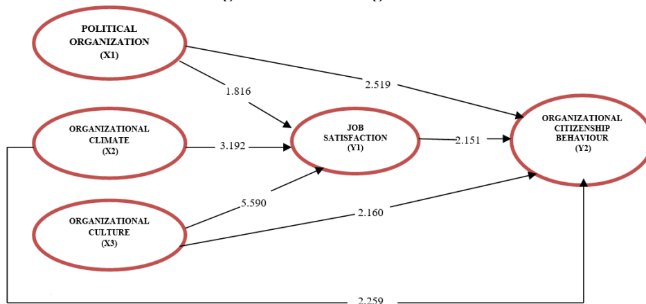
Figure 3: The Testing Result

From the results of hypothesis testing, it was political organizational not significant effect on job satisfaction and organizational climate has a positive and significant effect on job satisfaction. While organizational culture has a positive and significant effect on job satisfaction and political organizational positive significantly influence organizational citizenship behavior (OCB). Organizational climate has a positive and significant effect on organizational citizenship behavior (OCB). Organizational culture has a positive and significant effect on organizational citizenship behavior (OCB). Job satisfaction has a positive and significant effect on organizational citizenship behavior (OCB).