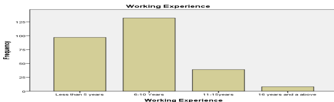
Fig 4.2 Working experience of the respondent

The study had investigated the work experience of employees in the institution and the findings were presented in the table below.