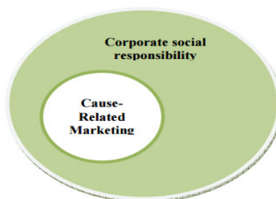
Figure 1: CRM is a part of social responsibility (Anghel)

The very first attempt to market for a cause or to initiate a CRM campaign was done by The American Express Corporate back in 1983. The corporate at that time have raised funds for the preservation of the statue of liberty. In no more than 4 months, the corporate managed to raise $1.75 million for that cause and its benefits went up to 28% (Laszlo & Lyons, 2014).