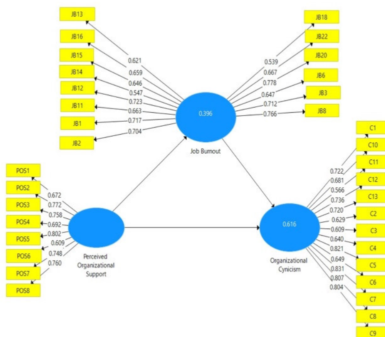
Figure 2. Path Model