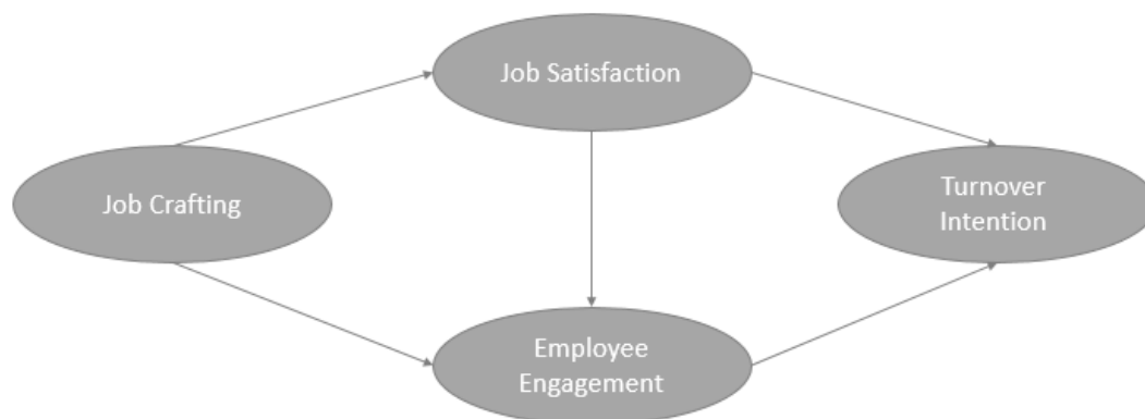
Figure 1. A theoretical model of hypothesis for the study