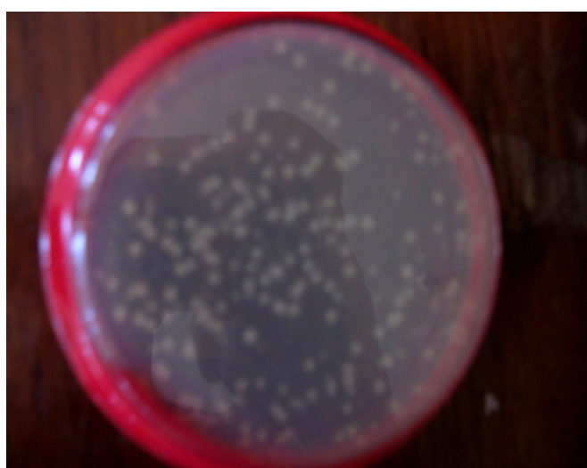
Figure1: Bacteria Growth on Plate count Agar (PCA)

Measuring total plate count is a convenient tool in assessing the general microbial contamination of foods and beverages (Simango and Rukure, 1992). The high total count uncounted in pre-bottled and bottled banana alcoholic beverages (Table 3 and 4) could have resulted from contamination from handlers during fermentation and post-fermentation especially the habit of not washing hands and addition of raw water in subsequent process.