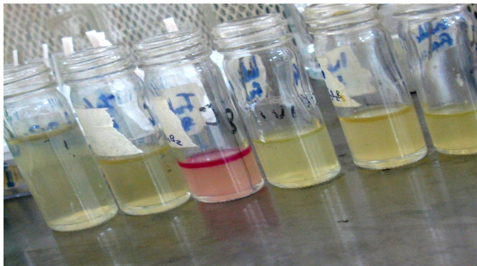
Figure 3: One of the Positive test for E. coli after Addition of Kovaacs Reagent (Bottle with Pink Ring Means Positive Results).