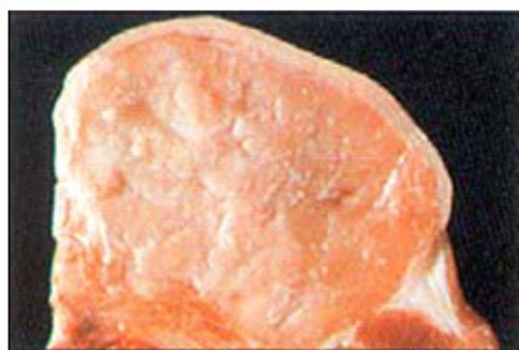
(B) Pale Soft and Exudative (PSE) meat.