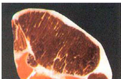
(C) Dark Firm and Dry (DFD) meat.