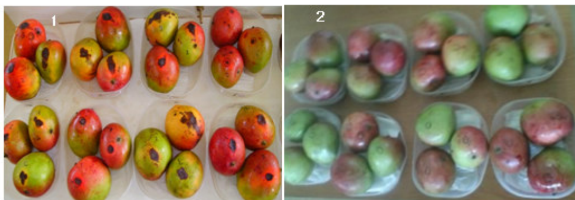
Figure 4. Pathogenicity tests Colletotrichum isolate collected from mango leaf, panicles and immature attached fruit of southwest Ethiopia, inoculated on mango fruit variety Kent. 1) Inoculated detached mango fruit symptom after five days incubation 2) Before inoculation.

Acervuli and conidia were observed in the necrotic areas of the leaves (Fig. 3). Colletotrichum isolate inoculated on physiological mature unripe detached mango fruit were infected and lesion began as dark black lesions with circular to irregular spot gray center were observed around the inoculation (Fig. 4) point three day after inoculation. re-isolation of Colletotrichum isolates from inoculated fruits and leaves were consistence and confirmed the pathogenic role of this organism. Please move this paragraph to above Fig.4.