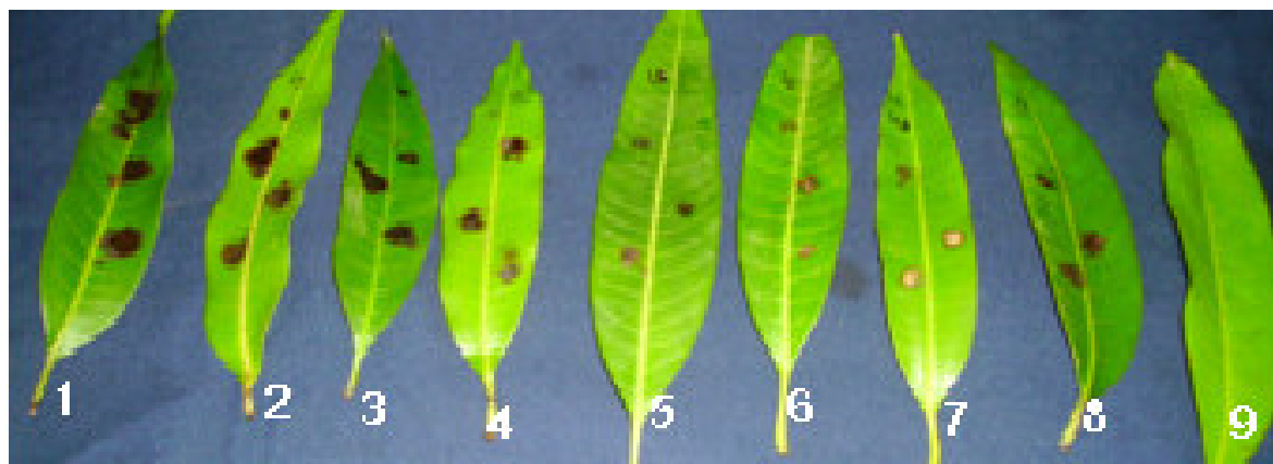
Figure 3. Pathogenicity tests with Colletotrichum isolates on mango leaves variety Kent. After 10 days incubation lesions caused by isolate 1) CGm-F, 2) CAAd-F, 3) CBk-F, 4) CMn-w, 5) CBm-T 6) CGL, 7) CSC, and 8) CBL-L. 9) Controls. Isolate 1,2,and 3 characterized by large, rounded black spots, whereas the necrotic lesions caused by isolate 4,5,and 6, 7 and 8 were surrounded by necrotic and black spots, indicating the region of growth of the fungus in the leaf tissue. Acervuli were observed on the necrotic tissues.