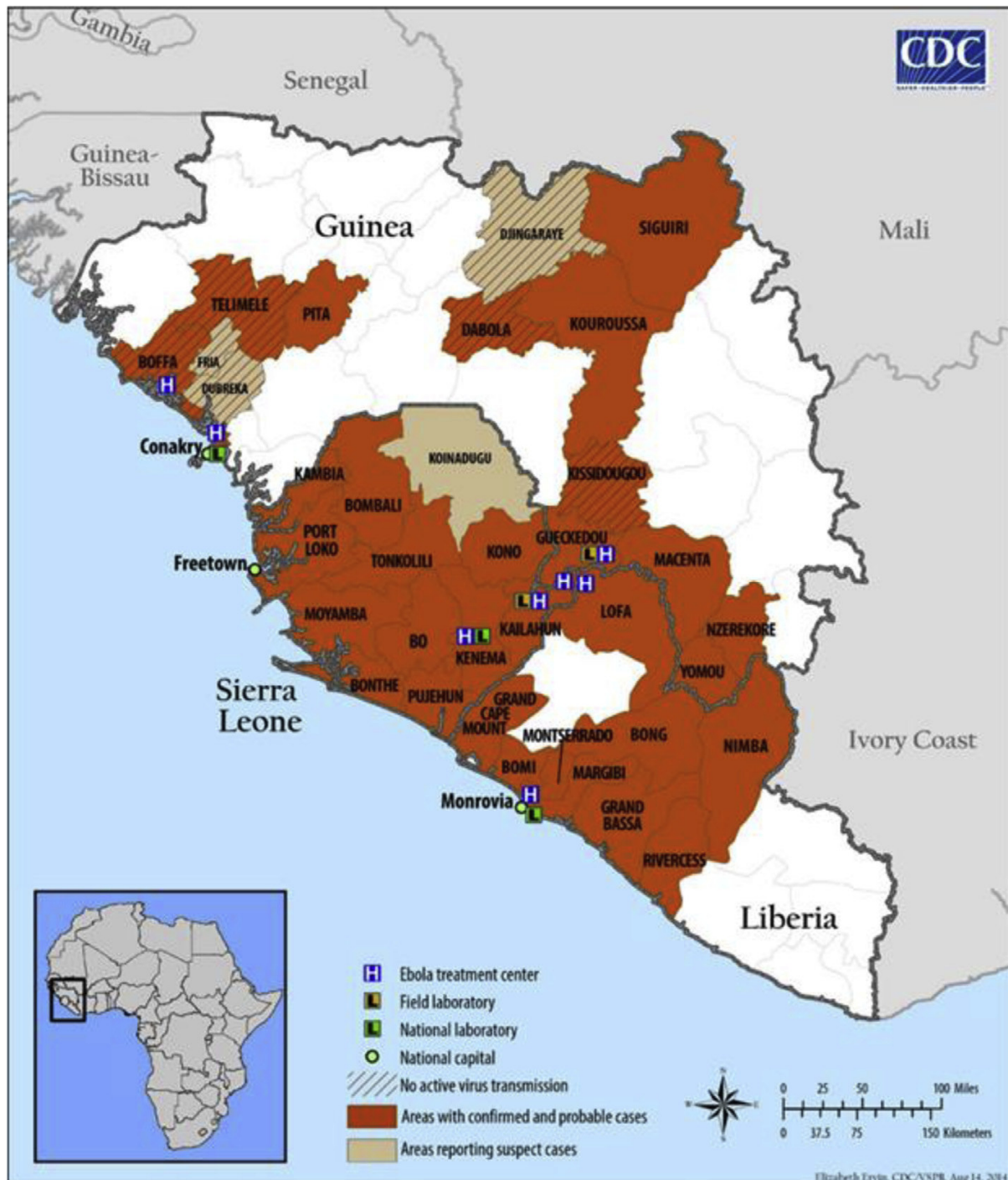
Figure 1. Centers for Disease Control and Prevention map of 2014 Ebola outbreak in West Africa outbreak distribution map, updated September 17, 2014.

Of the 5 species of Ebola virus, only 3 are of human significance and have also been implicated in large outbreaks: Zaire, Sudan, and Bundibugyo. Bundibugyo and Sudan have a fatality rate of approximately 25% and 50%, respectively (Pigott, 2005). A fourth species, Côte d'Ivoire virus, was responsible for a single case in 1994 in Côte (Feldmann and Geisbert, 2011). The fifth species, Reston virus, was found in the Philippines and the United States (Preston, 1995) but is not responsible for any symptomatic disease in humans to date (Barrette et al. , 2014).