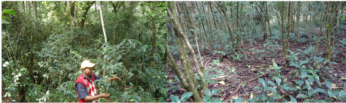
Fig 1 Over view of the Yayo coffee forest(left) . Naturally grown coffee seedlings Yayo forest (right)