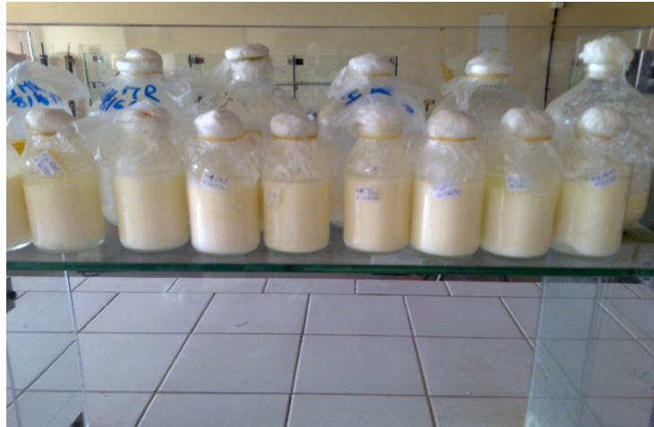
Photo 1. Different lactic leavens prepared