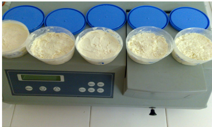
Photo 2. Different products manufactured in the laboratory